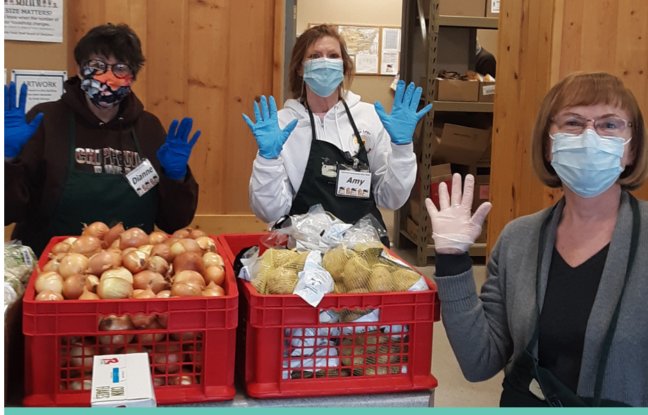
Hayward Community Food Shelf volunteers