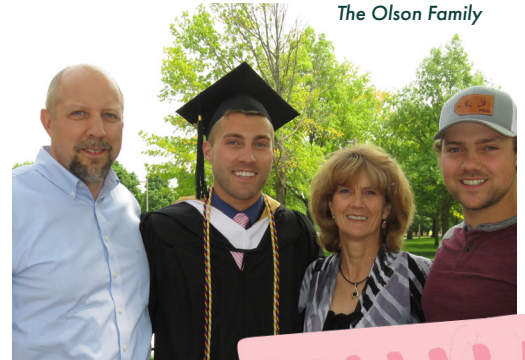
The Olson Family

Every $1 given provides 4 meals for a neighbor in need.