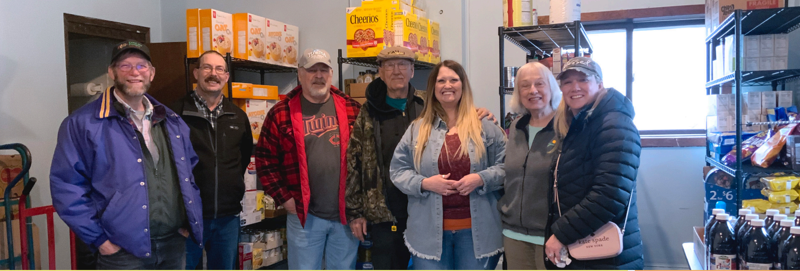
Volunteers at The Community Cupboard in Augusta on its first day of distribution in April.